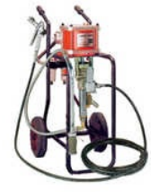
Sagar Airless Painting Equipments