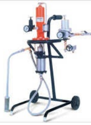
Paint Transfer Pump