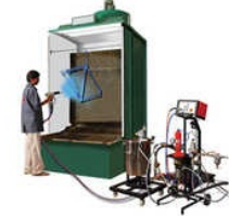
Liquid Painting Booth