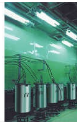
Paint Kitchen System