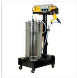
MAGNUM POWDER COATING EQUIPMENT

Aerorail Conveyor, Auto Airless Spray Gun, Auto Electrostatic Spray Gun, Auto Gun, Automated Storage, Automatic Lubrication Unit, Bell Applicator, Bread Pan Coating, Caterpillar Type Positive Transmission Drive Unit, Charjet Manual Applicators, Closed Track, Disc Applicator, Electric Electromechanical Reciprocator, Electric Pneumatic Reciprocator, Electric Retriever, etc.