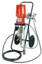
Sarita Airless Painting Equipments