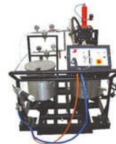
Mobile Paint Circulation System